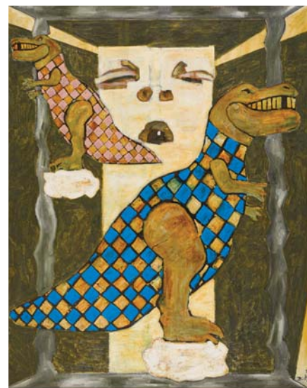
Moderne Kunst kann man verstehen, moderne Welt nicht (One can Understand Modern Art, but not the Modern World) 1985 Oil on canvas 150 x 120 cm