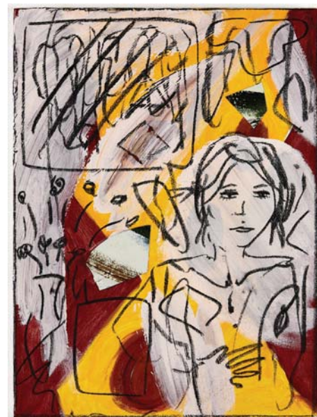
Sofia Silva The Paduan Painter 2017 Oil and charcoal on canvas 40 x 30 cm

In the painting field, 'intelligence' is a word going through its own personal Dark Age. For many, the 'intelligent painter' is whoever deviates from supposedly 'real' painting of the knee-jerk, gut-reaction kind. But the intelligent painter is really much more than that; intelligence in painting is knowing how to express a circle without tracing any circle, how to draw a single straight line to mean a vase full of flowers, how to make a political statement exploiting the sole absence of tonal contrast. Gut instinct may lead to the discovery, but it's intelligence that transforms it into an invention capable of being forever original. More than anyone else, Büttner underlines the fact that a painter who is not intelligent is nothing.